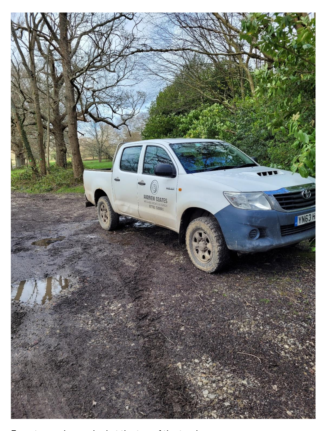
Forestry worker parked at the top of the track.