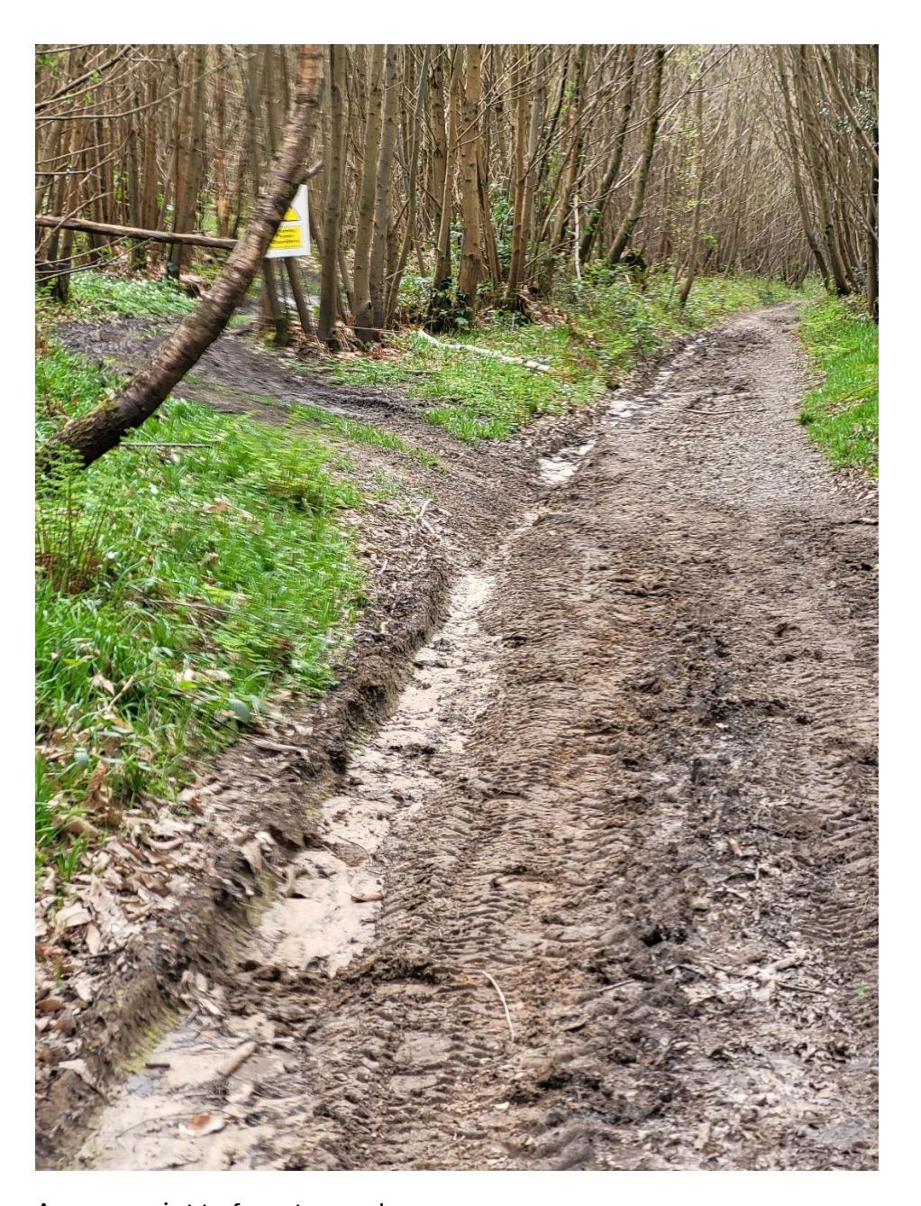
Access point to forestry work