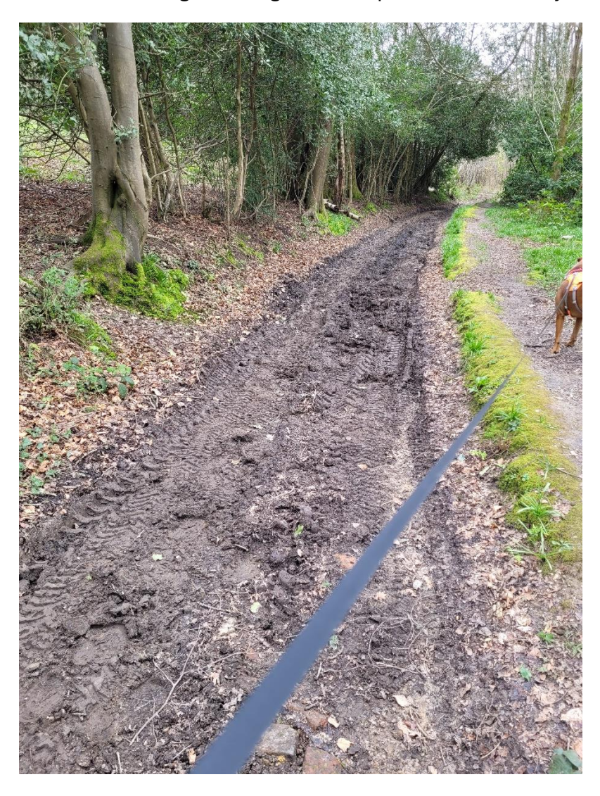
Top of the track