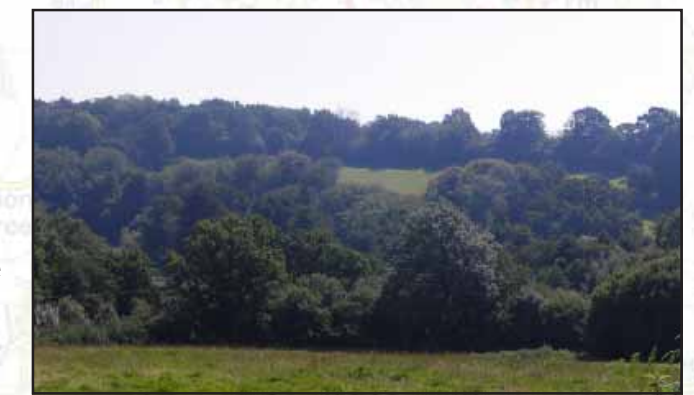
View from the Walk

Follow route ahead, with the hedge to your left, and turn left over the stile, cross the field, and then the driveway to Foxhole Farm. Continue to follow the waymarked route, crossing a number of fields, before turning right on reaching a track. Follow the path down hill through the woodland, and then continue up hill to reach a lane. Continue straight along Church Lane, and then ahead, as this changes into Church Road. Follow the road, passing St. Marys Church, back towards the centres of Buxted. At the junction with the main road, side the village shop, turn right, and follow the main road back down hill towards Buxted station and the end of the walk.