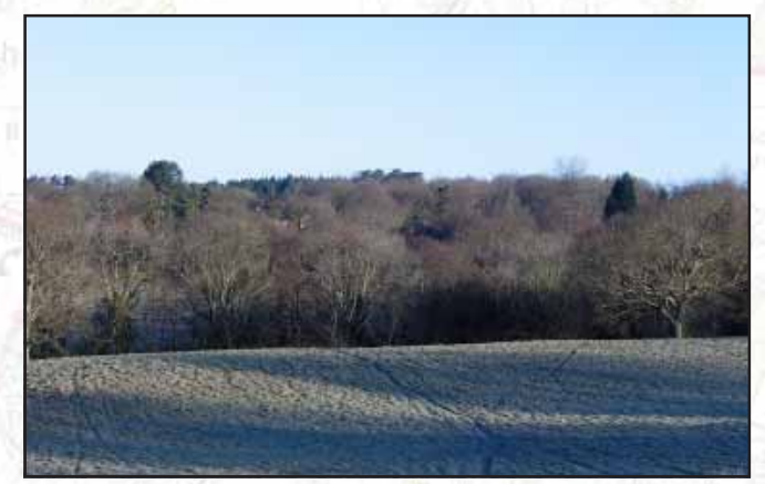
Frosty morning view

Starting from Buxted Railway Station, turn left on leaving the car park, and head up hill through Buxted village centre. On reaching the village shop, cross the road and continue in the same direction.